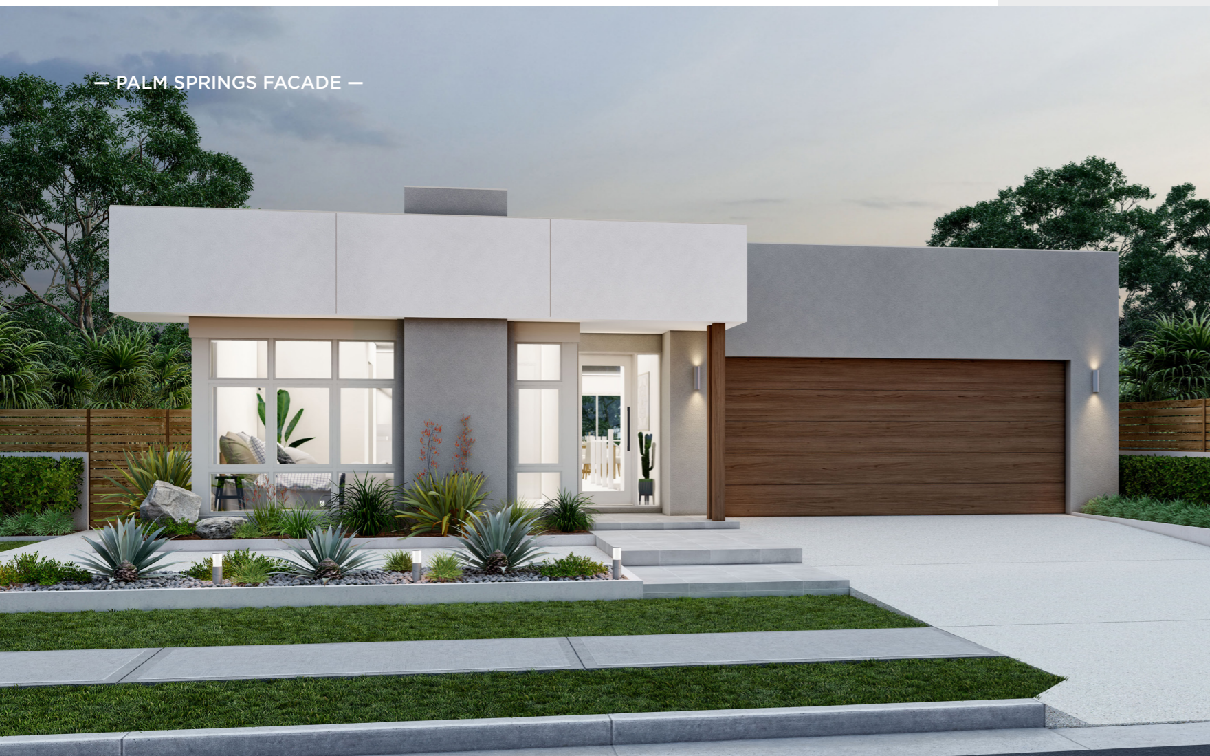
— PALM SPRINGS FACADE —