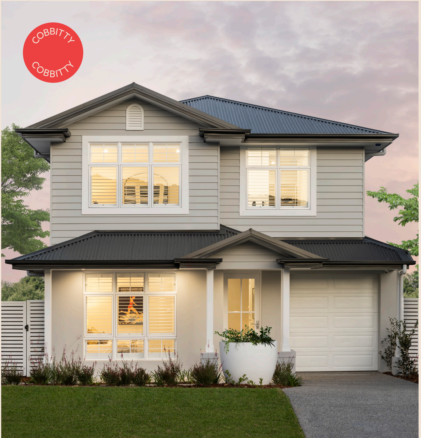
East Hamptons Facade

The Enmore 29 home design seamlessly blends functionality and modern aesthetics, featuring a dedicated home theatre for an immersive entertainment experience. The inclusion of a home office provides a versatile space for remote work, while the L-shaped layout of the dining, living, and kitchen areas promotes a fluid and open living environment. Upstairs, the four bedrooms offer privacy and comfort, complemented by a children's activity room and a study nook, catering to the diverse needs of a contemporary family lifestyle.