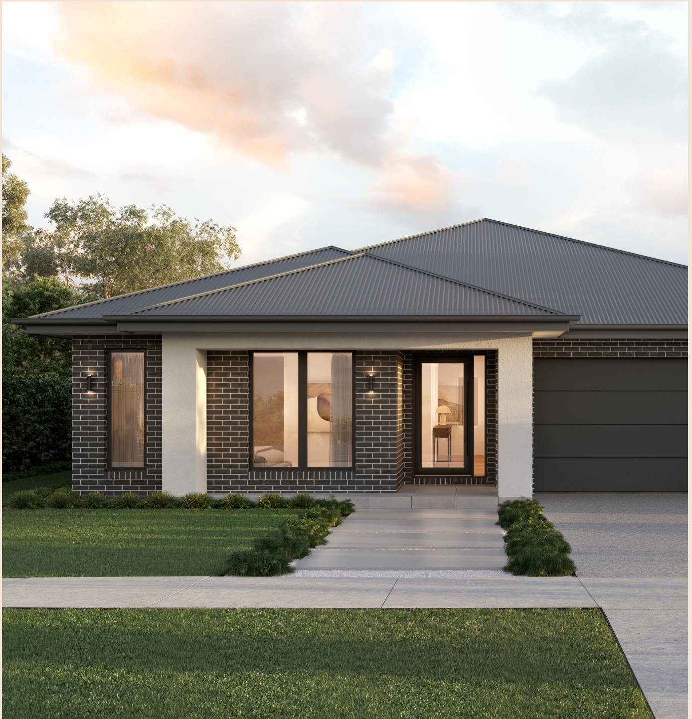
Modern C Facade

The Essence 26 offers the perfect blend of space and comfort for a modern family living. With four spacious bedrooms, an open-plan kitchen with a walk-in pantry, and a dedicated home theatre, it's ideal for those seeking both style and functionality. Plus, the outdoor living area ensures seamless indoor-outdoor flow, perfect for entertaining or relaxing.