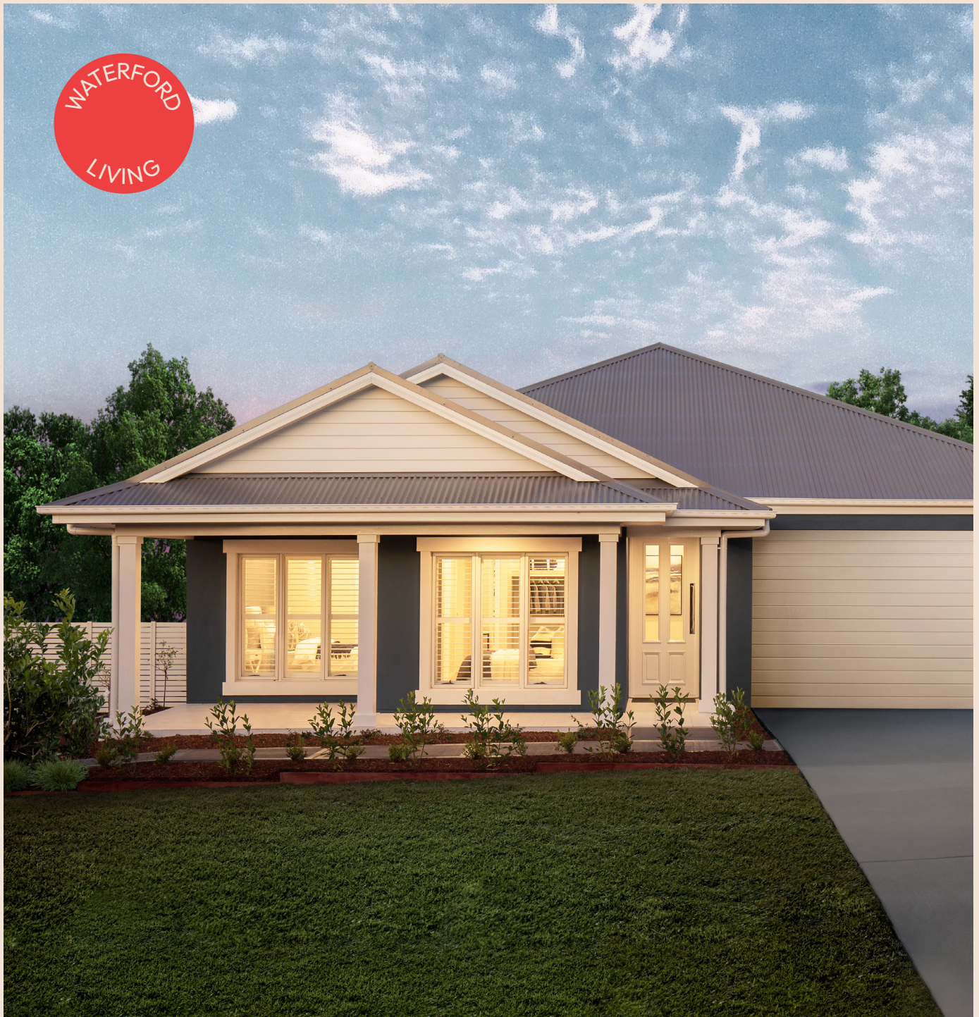
South Hampton Facade

There's something incredibly luxurious about the Oasis 31. With its timeless design, it is the perfect setting for a family to revel and relax in the comfort of the plentiful space. Presided over by a beautiful designer kitchen, the spacious living and dining zone is the heart of the home. Located at the rear, it's a dynamic space designed for happy family life, with a light airy feel, that makes everyday a breeze. Four bedrooms provide plenty of privacy for everyone, with additional spaces, including the home theatre and children's activity room, providing extra rooms for the family to escape to.