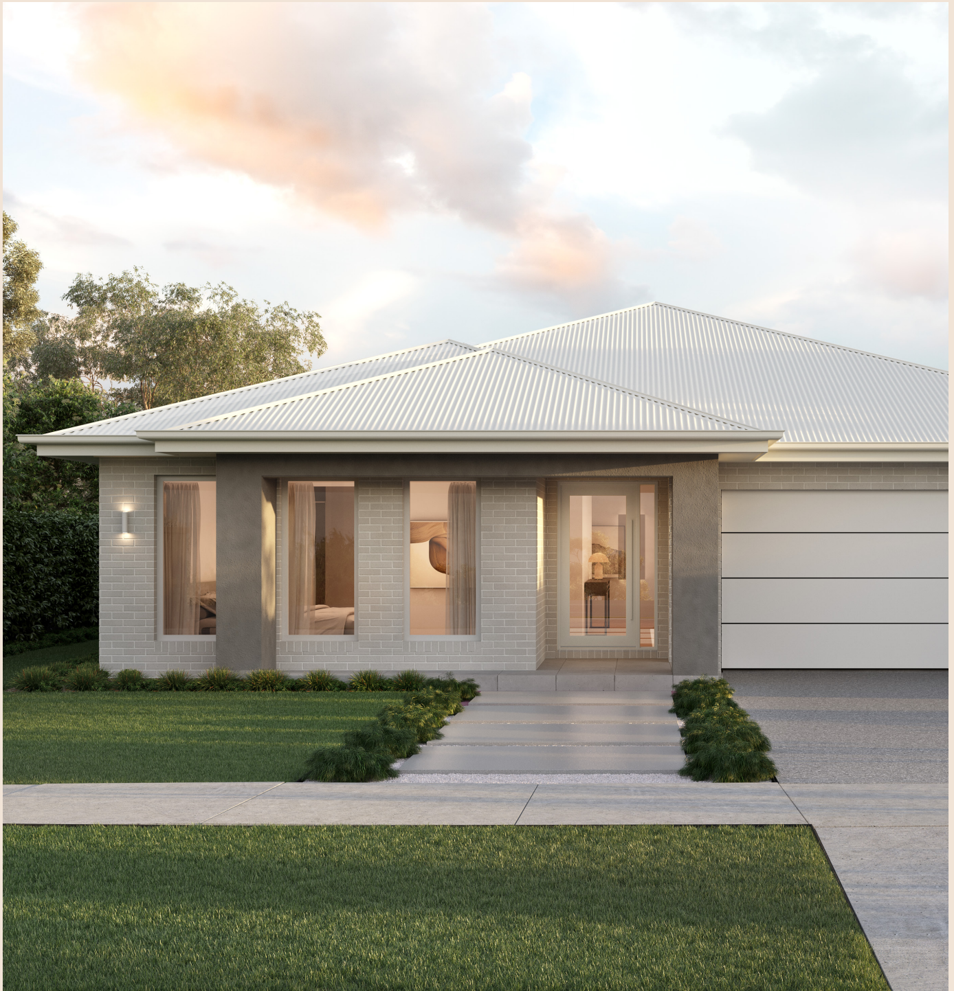
Modern B Facade

Ready to live large? The Oasis 33 is the perfect home for you. Its sun-filled, open-plan rear living area is made for entertaining, seamlessly connecting to the outdoor space and home theatre. Whether you're hosting special occasions or enjoying cosy nights in, this space adapts to your needs. Thoughtful details like a study nook, coat robe, walk-in pantry, and built-in desks and robes add to the home's convenience and comfort. With everything designed for modern living, the Oasis 33 is a place you'll love for years to come.