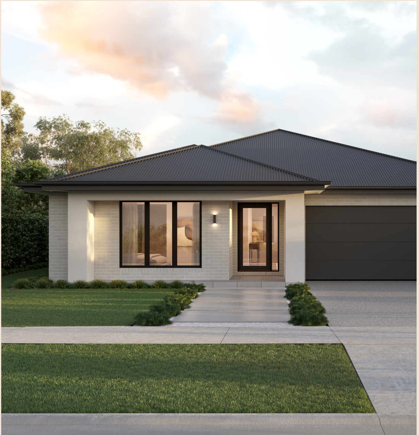
Modern A Facade

This home combines a clever layout with effortless functionality, flexibility and a host of different ways in which you can embrace life every day. Four bedrooms. Outdoor living. Study nook. Separate children's activity. It's up to you how you want to live here, with the clever layout and various conveniences making almost anything possible. All it needs is your personality to complete your home.