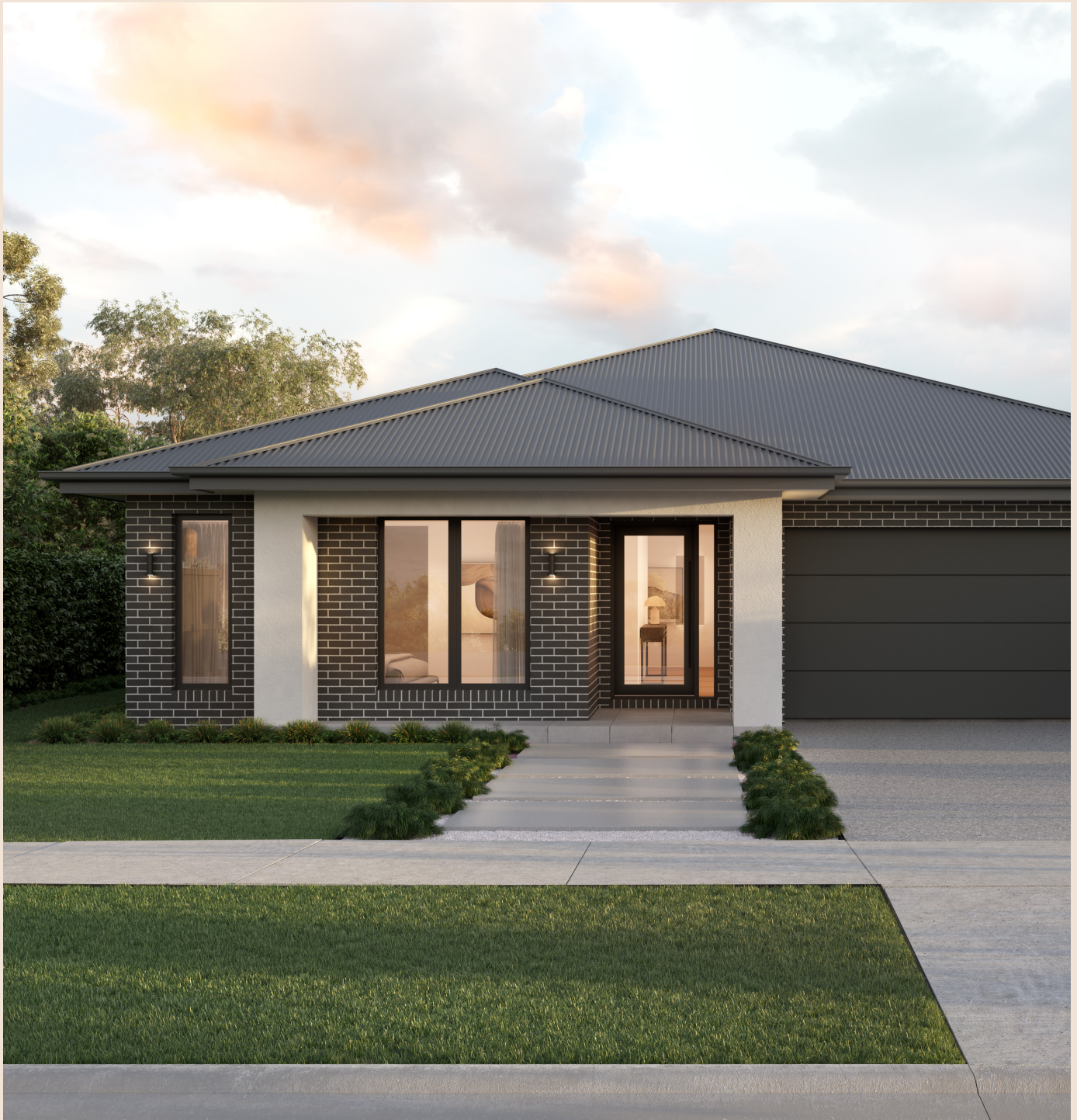
Modern C Facade

Love the Rhapsody 24 but just need a bit more space? Then you'll be smitten with the 4 bedroom Rhapsody 28. With all the effortless functionality, flexibility and style of its little sister, this home is four squares bigger and gives you more room to move. It offers a slightly more generous proportion, with some small tweaks to the floor plan enhancing its roomier flow including the walk-in linen. Plus a more expansive configuration in the master bedroom and walk-in robe so you can squeeze in more of your favourite fashion items, as well as a slightly different layout in the kids' wing at the rear - You'll just love it all!