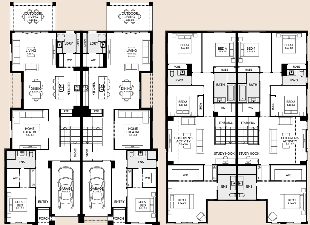
Hamptons A Facade